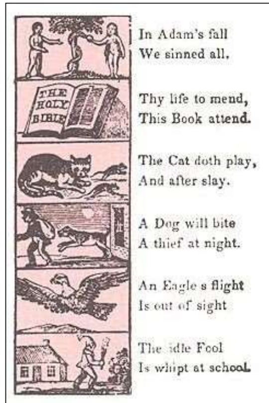
From the 1690 textbook, “The New England Primer”