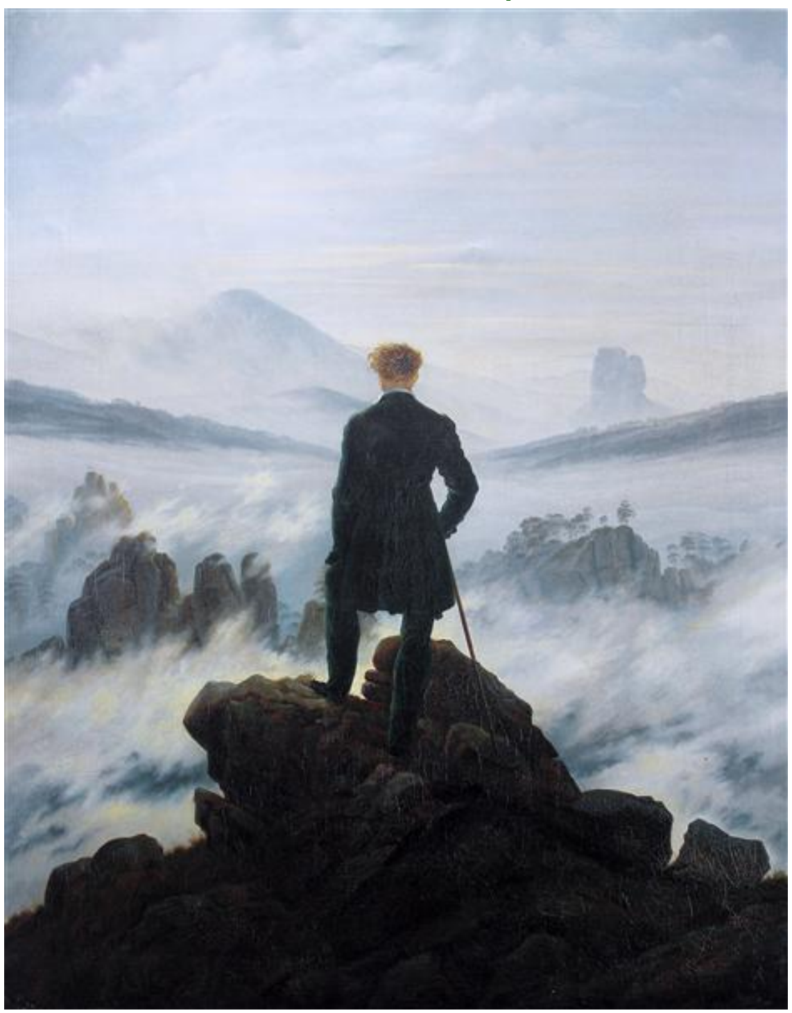
The Wanderer Above the Sea of Fog, Caspar David Friedrich